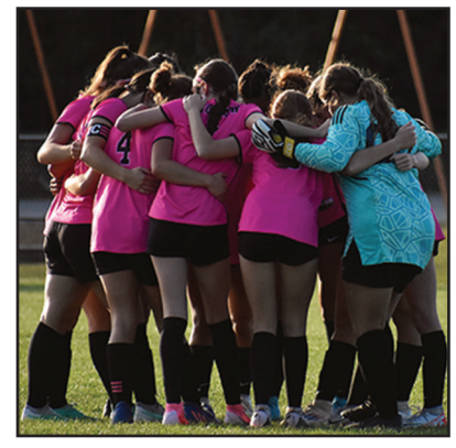
The girls soccer team huddles up at the beginning of the game. The Lady Woodmen beat Indy Genesis 5-1 on Senior Night.