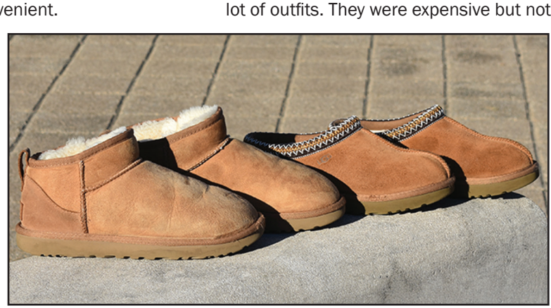
types," Loper As fall approaches, local stores sell out of Uggs every year.