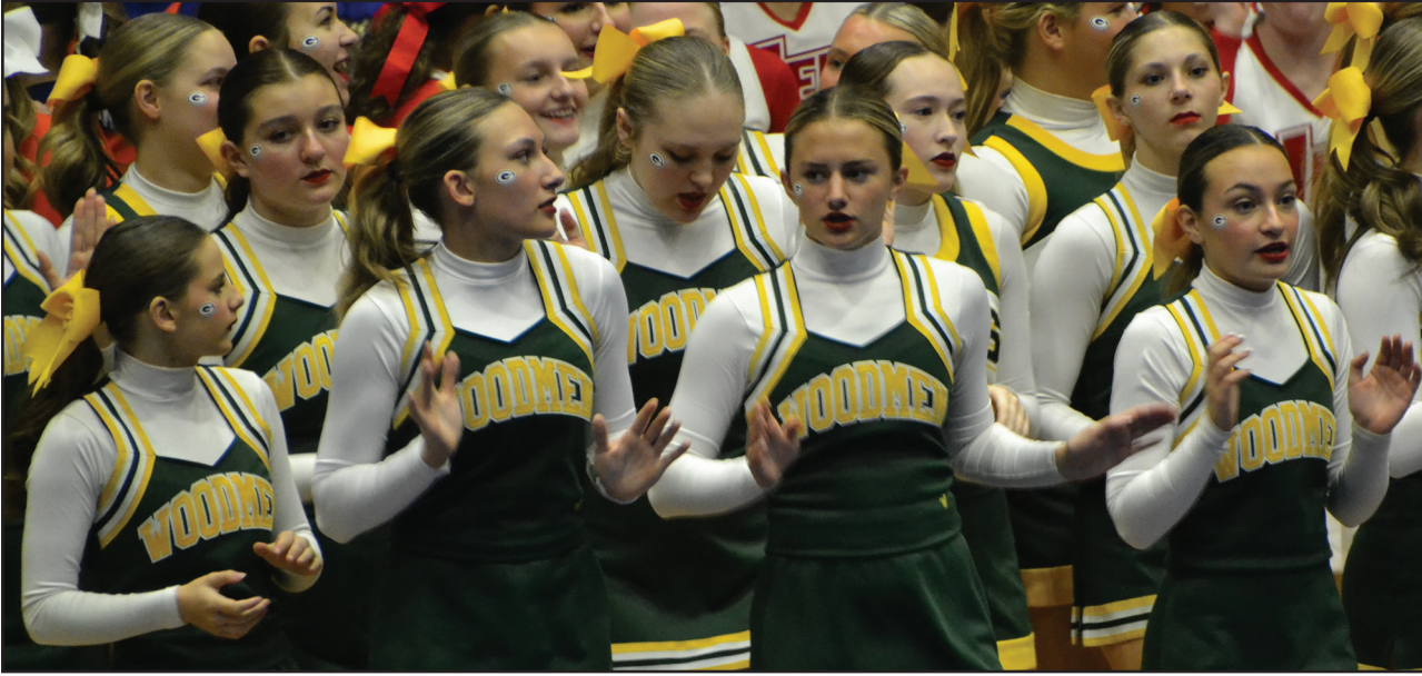
The cheer team anxiously waits their results at the State competition. The Woodmen took home 14th place.