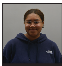
By Deiana Forde copy editor

Lights twinkle and flash red, green, and gold, luminating the streets of downtown Indianapolis.